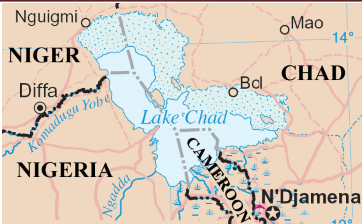
Fig. 1. Shows the lake chad basin: Source: Wikipedia (2012)