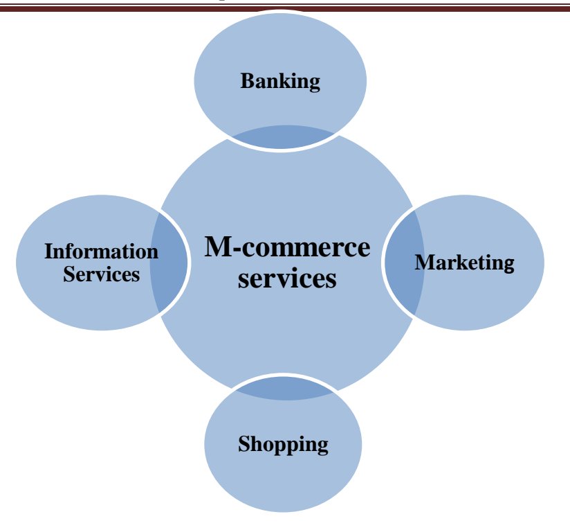
Figure 2 M-commerce Services