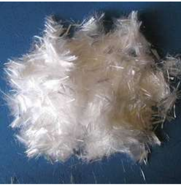
Figure 1: Recorn 3s Fibre

Table1: Compressive Srength of Concrete (M30) For Different Percentages of Additives For W/C Of 0.4