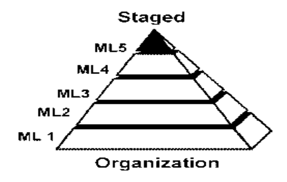
Fig 1: Staged representation of maturity levels in CMMI

Continuous Representation it has the same basic information as the staged representation, which arranged differently, provides maximum flexibility. In this each process capability level ranges from 0 to 5 which are depicted in figure 2. The continuous representation provides flexibility for selecting processes fit for achieving business goal of the organization [7].