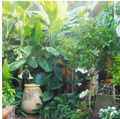
Figure 6. Innercourt and Trees Planted in Front of Residential Houses

Provide an element of vegetation in the form of an inner court as an alternative to green open space on land used for housing development. Also provides vegetation in the form of grass and trees in the area defined by the green basic coefficient (KDH).