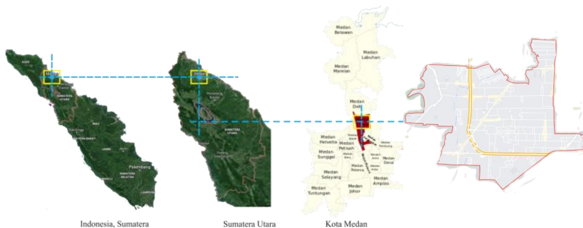
Figure 1. Site Map

The location determination is determined based on the availability of vacant land so that the residential house can be built after being planned and designed. The location is on Jalan Sei Padang, Medan Selayang.