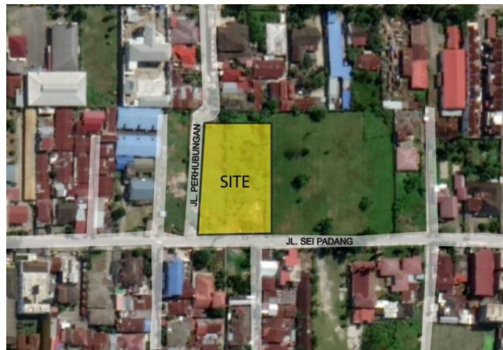
Figure 3. Site location selection