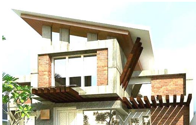
Figure 5. Front view of the house after it was built and occupied

Seen in the picture above, in the view of the residential house, concrete canopies are given to the windows and doors so that solar radiation does not enter the whole house. The result after being built and occupied can be seen in Figure 3.