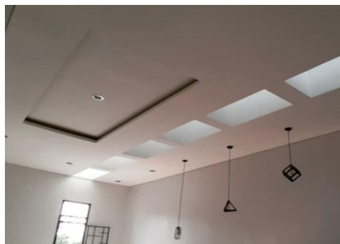
Figure 8. Use of Skylights in Residential Houses