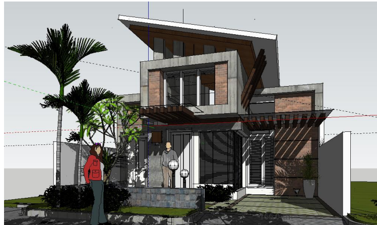
Figure 4. 3D Residential House