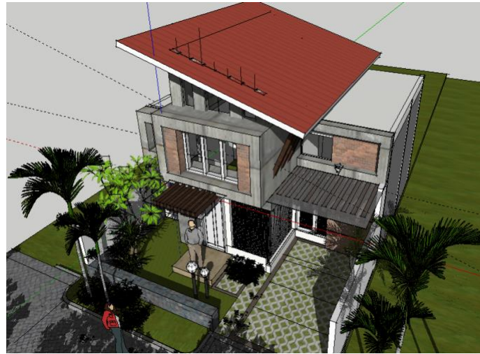
Figure 7. Concrete canopy placed on every window and door facing north