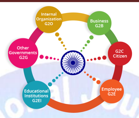
Figure 1: E-Governance Components

Nowadays use of information and passing message technologies has become a core part of everyday work. Due to this many approaches to describe e-government as well as its study has also been increased in last two decades ,as a result digital government research have been evolved to a new level. There are many approaches to describe the evolution of e government. One of them is described as the evolution of e-government initiatives in terms of their degree of technological and organizational sophistication.