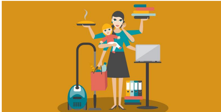
Image 1.1 Different Challenges Faced by Women Entrepreneur.

There are a so many Challenges Faced by Women Entrepreneur. Among which 4 are studied and explained below: